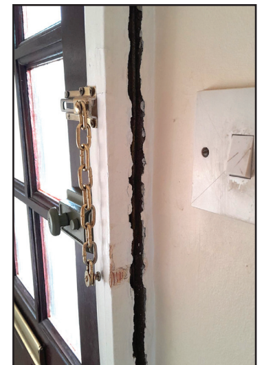
Serious damage: An inside view of the door kicked loose from its frame

adds: "Have they even considered they could kick down a