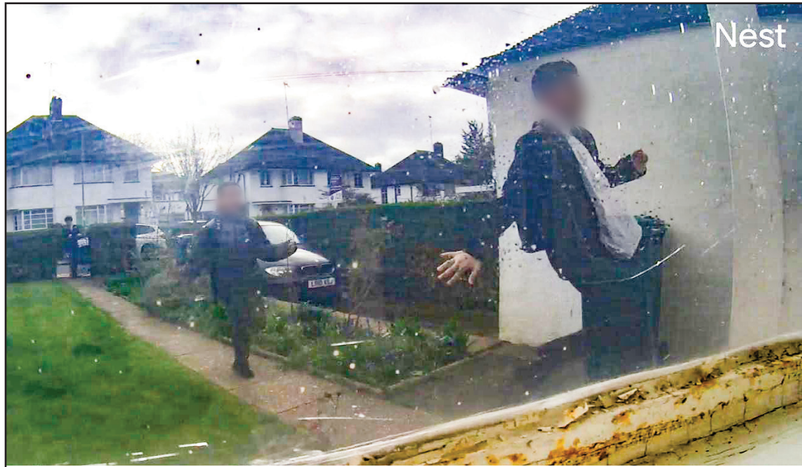
Kicks for kicks: Three students are caught on a security camera approaching the front door of a house in Ludlow Way, N2

"Whatever it was had split the front door frame from top to bottom. We called the police who came quickly and they were as mystified as us. They even asked us if we had any enemies. That night we just couldn't sleep. Gina has lived here for 48 years and was really, really upset." All was revealed the following morning when another four households in Ludlow Way were woken by a similar experience, and video doorbell footage clearly identified three boys taking it in turns to violently kick the front doors, with one of them filming the action. A quick-thinking neighbour drove around the streets and found them. They were all pupils of Christ's College Finchley (CCF), off East End Road. The school have confirmed this and have supplied The Archer with the following statement: "The school is aware of an ongoing police investigation and is fully co-operating with the police. As this is an active police investigation, we are not able to disclose any further details". What the CCF students were doing was taking part in the 'Door Kick Challenge', which has gone viral on social media.