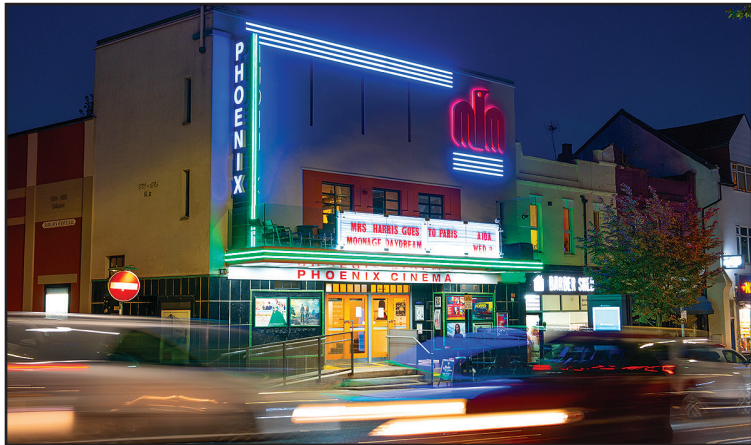
New status: The Phoenix Cinema

Quite apart from new financial support needed to improve toilets and facilities in the foyer, considerable investment is required to ensure that the Phoenix can remain open for business. Chair of the Phoenix