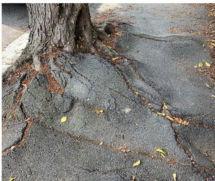
Watch your step: A mountainous tree root is just one of the pavement obstacles in Sylvester Road.

People aged in their 70s, 80s and 90s are calling for action after being forced to walk in the middle of the road to avoid dangerous trip hazards on the pavements.