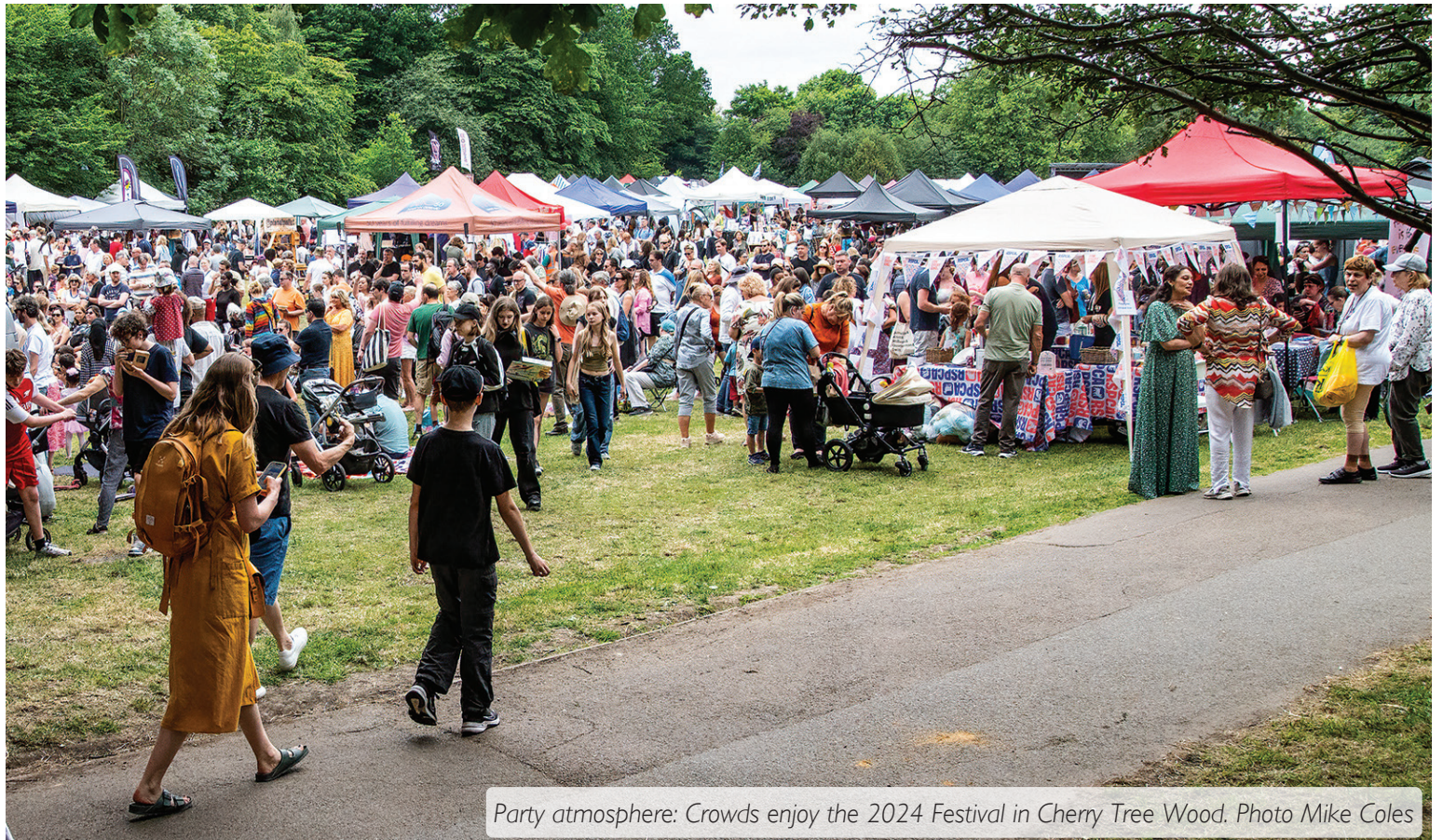
Party atmosphere: Crowds enjoy the 2024 Festival in Cherry Tree Wood.

Following the success of last year's 50th anniversary Parade, festival-goers are invited to come along early to join in this year's Parade, which will begin at Martin Primary School, Plane Tree Walk, N2, at 11.30am and proceed down the High Road to reach the festival at midday for the opening ceremony.