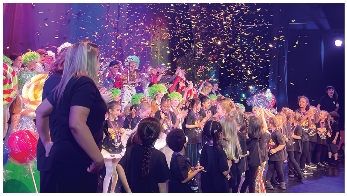
Show time: Youngsters on stage at the end of a Fixation Academy production

East Finchley Allotments was established in 1917 and is one of the largest sites in Barnet. Leased from Barnet Council it is managed by plot-holders as a community-run concern.