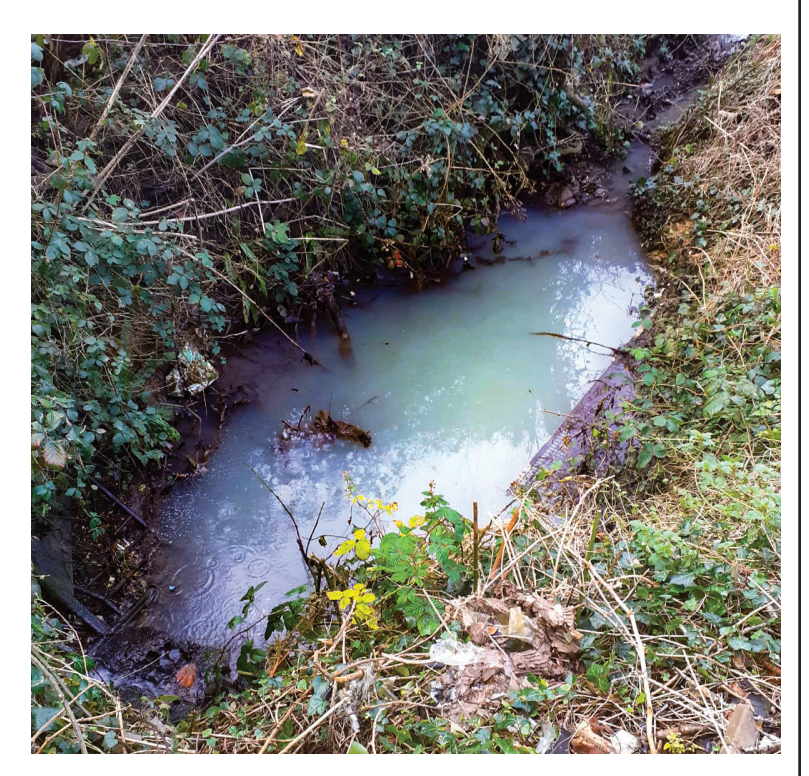
Discoloured: One of the polluted allotment streams