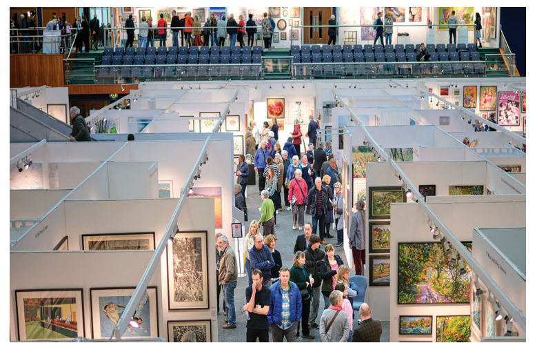
Original works: The Fresh Art Fair is coming to Alexandra Palace