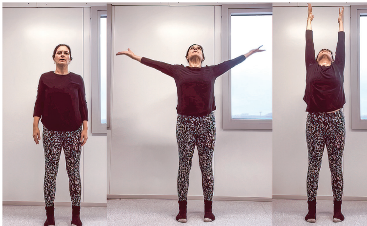
Stretch to the light: Yoga for winter days

This will encourage your breath to draw deeper into your lungs, help open your chest & heart centre and will assist you in being present in the here and now. Find out more at https://stretchingpeople.co.uk/