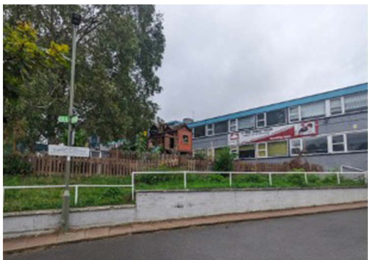
Established: Monkey Puzzle Nursery. Photo Places for Barnet.

Find out more at efgirls.co.uk and efwfc.co.uk