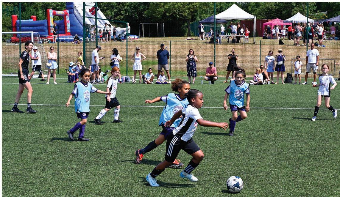
Fast on their feet: Young players take part in the football tournament at Christ's College Finchley.

“We appreciate that in London, affordable housing, none of which is being built on