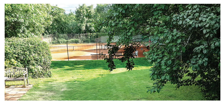
Green oasis: The Fortis Green Tennis Club