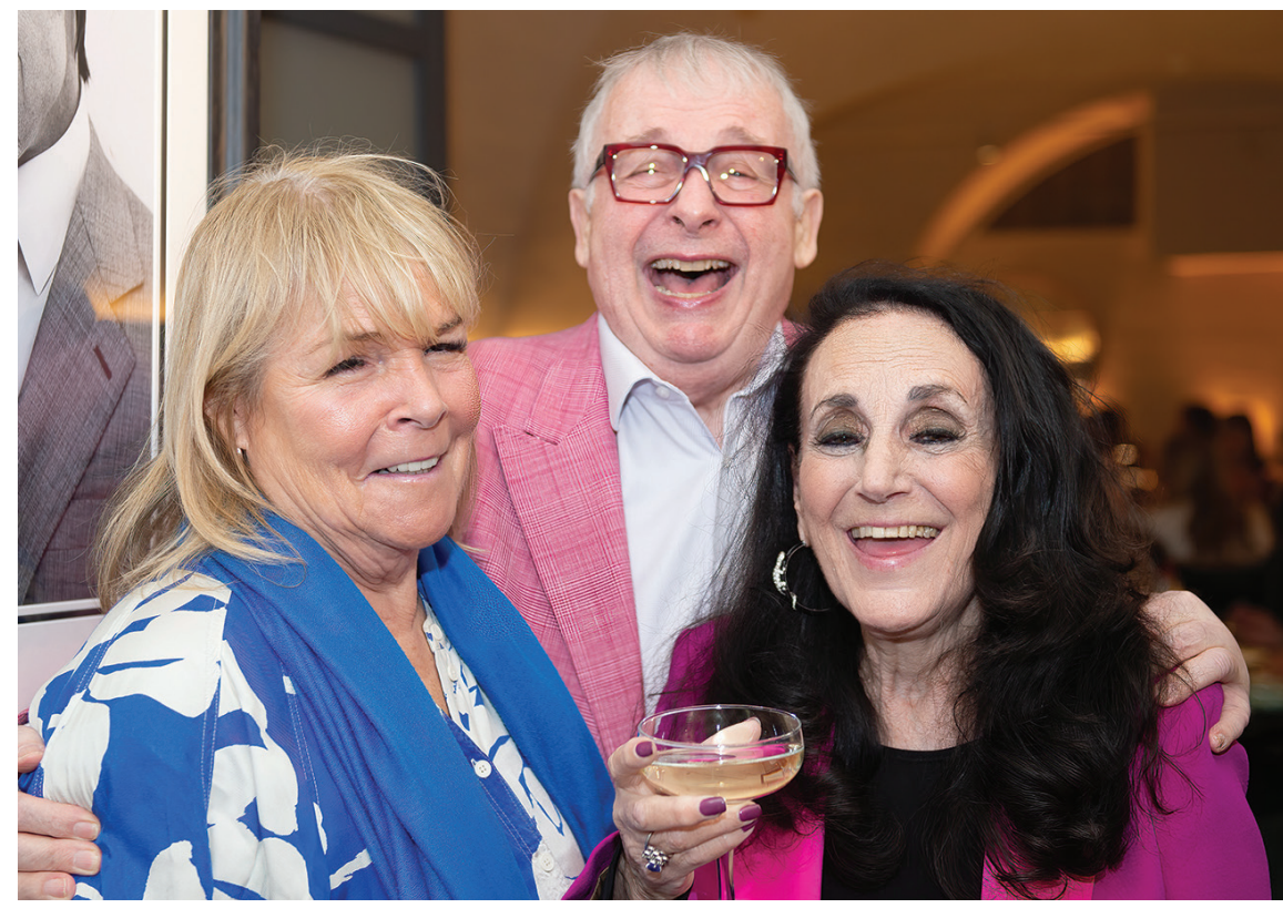
Raise a glass: Birds of a Feather stars Linda Robson and Lesley Joseph with comic actor Christopher Biggins at the North London Hospice fundraising event.

A London Fire Brigade spokesperson said: "Ensuring the safety of those using the London transport network is our priority. We are working with Transport for London with regards to their responsibility to remove all book libraries from subsurface stations. This is due to combustible material posing a fire safety risk if it is stored on these premises. Nonsubsurface stations have been asked to remove book libraries from display until they have the correct fire safety plans in place." Your letters Pg11.