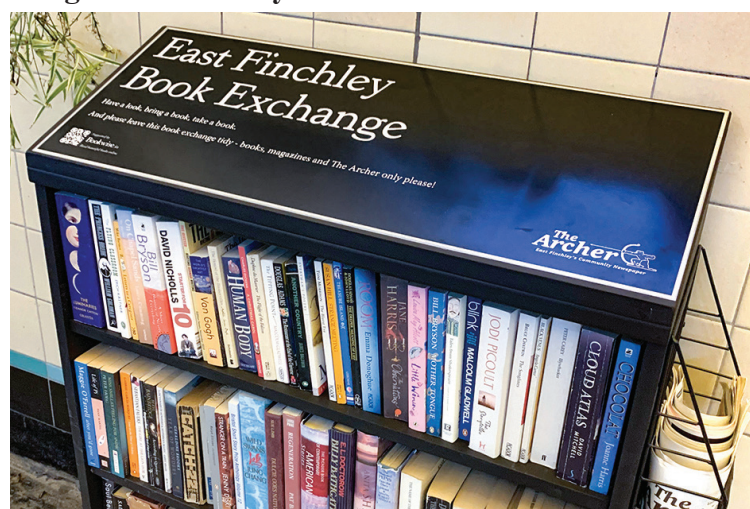
Well stocked: The station book exchange was a popular way to share good reads

Commuters and residents reacted with dismay after the popular book exchange at East Finchley tube station was suddenly closed last month and the shelves removed altogether a few days later.