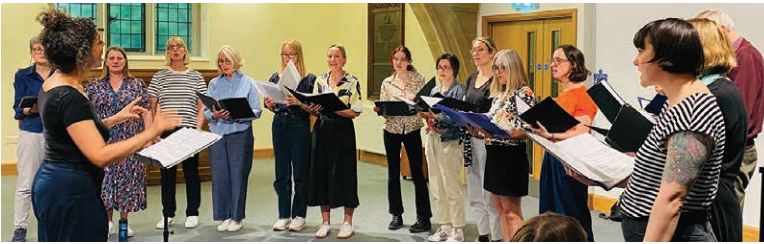
In good voice: Coldfall Community Choir raise money for the Bounds Green Foodbank