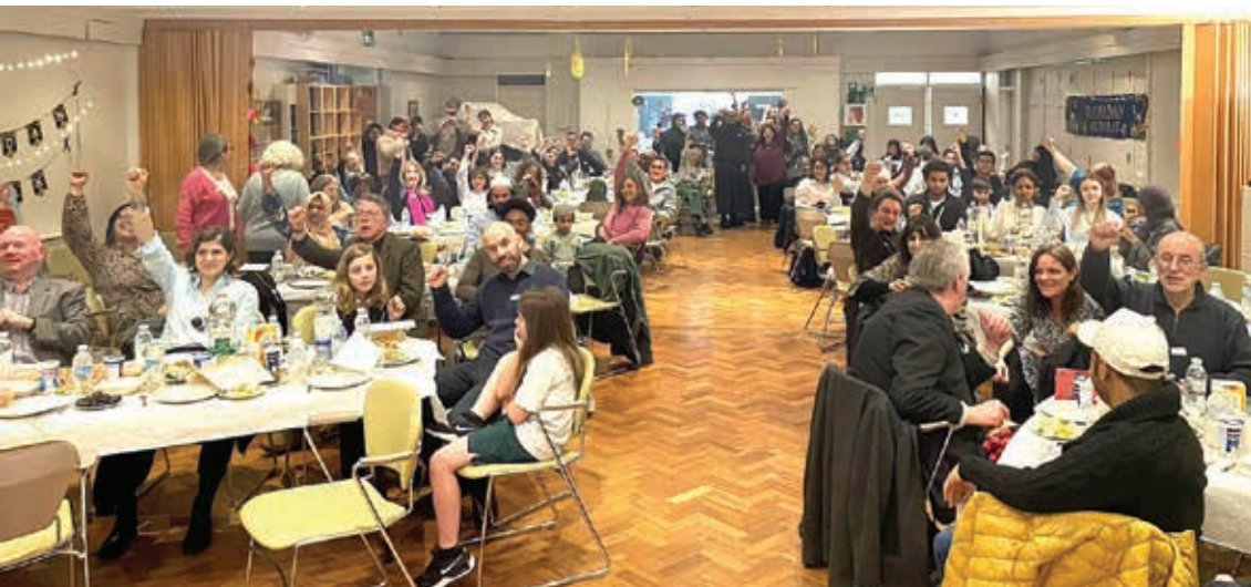
Breaking bread: People of all denominations and none enjoy the Iftar meal together.

There followed a delicious vegetarian meal at which the guests were encouraged to speak to people whom they did not know. Some did, others didn't, but it was nevertheless a very lively and joyous occasion.