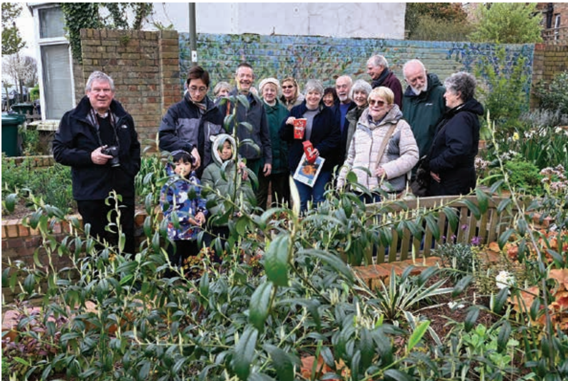
Pocket garden: Residents and volunteers at the environmental award presentation in Leopold Road