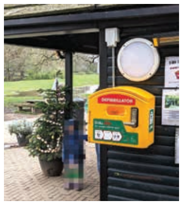
'Emergency use: The defibrillator at the Cherry Tree Café

The Friends of Cherry Tree Wood ask park users to take time to read the instructions or check out the advice on the St John's Ambulance website at www.sja.org.uk . No special training is needed to use it.