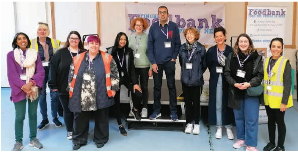
Join the team: Some of the food bank volunteers who already give their time to help people in need.