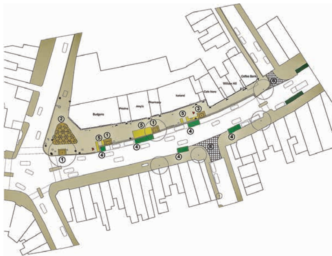
Formal designs: The scheme to be submitted to planners shows: 1) larger planted areas for existing trees; 2) a new grove of cherry or birch trees; 3) a new London plane tree; 4) rain garden sustainable drainage; 5) seating and stage areas; 6) raised table at pavement level.

If you have comments on the designs email estownteam@gmail.com before the end of March.