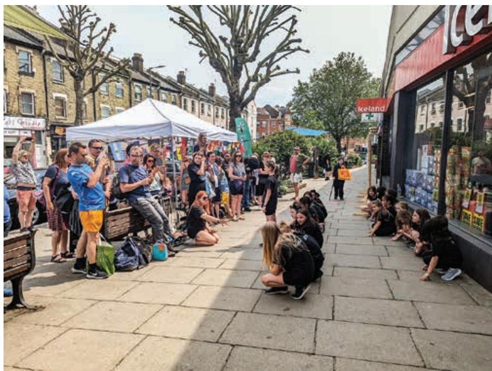
Leafy: An aerial view of the new trees, seating and performance area on the redesigned pavement and, right, the area as it looked during the ideas event last summer

Plans can now be revealed for transforming the wide area of pavement outside Budgens and Amy's in the High Road into an attractive new town square for East Finchley. Designs have been drawn up by local architects MillsPower at the request of East Finchley Town Team, whose aim is to boost trade for N2's venues and shopping areas.