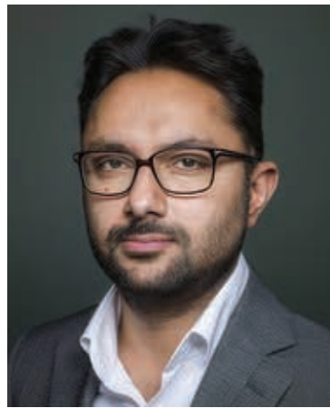
Author insights: David Baddiel and Sathnam Sanghera