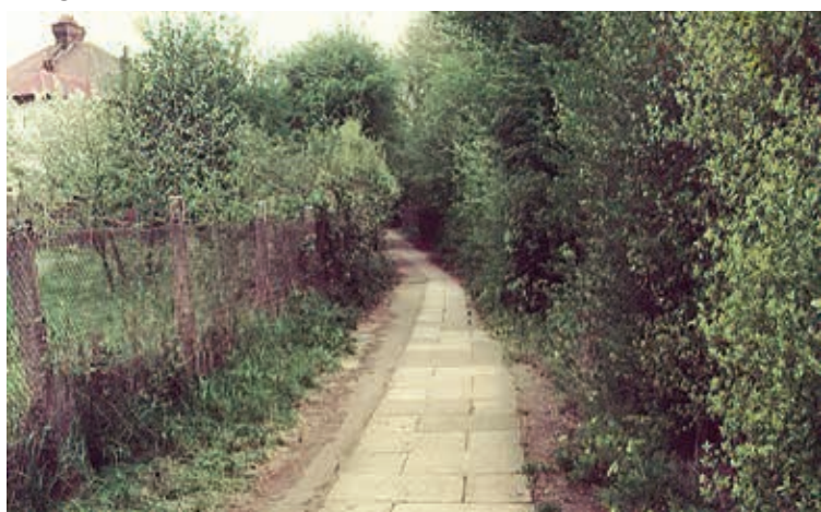
Station path: The scene, on what is now Deanery Close, where Mr Littler was set upon.

On Sunday 10 December, the Metropolitan Police arrested a 58-year-old man on suspicion of murder. Three days later, a 54-year-old man was also arrested on suspicion of murder. Both men were released on bail to dates later this month, pending further enquiries.