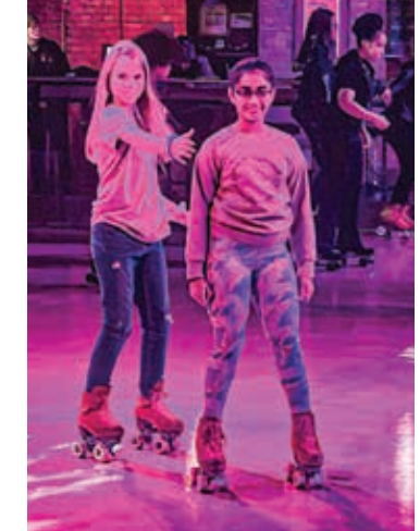
Birthday party: Monday Club members have fun at Roller Nation in Tottenham

Congratulations to all concerned and roll on the next 18