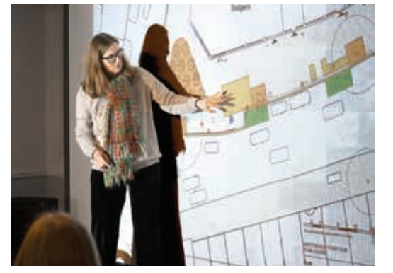
Transformation: Pavement plans on show.

are held at the Constitutional Club, 9 The Walks, N2 8DE at 7pm for a 7.30pm start on the second Thursday of the month. Contact eftownteam@gmail. com for more information.