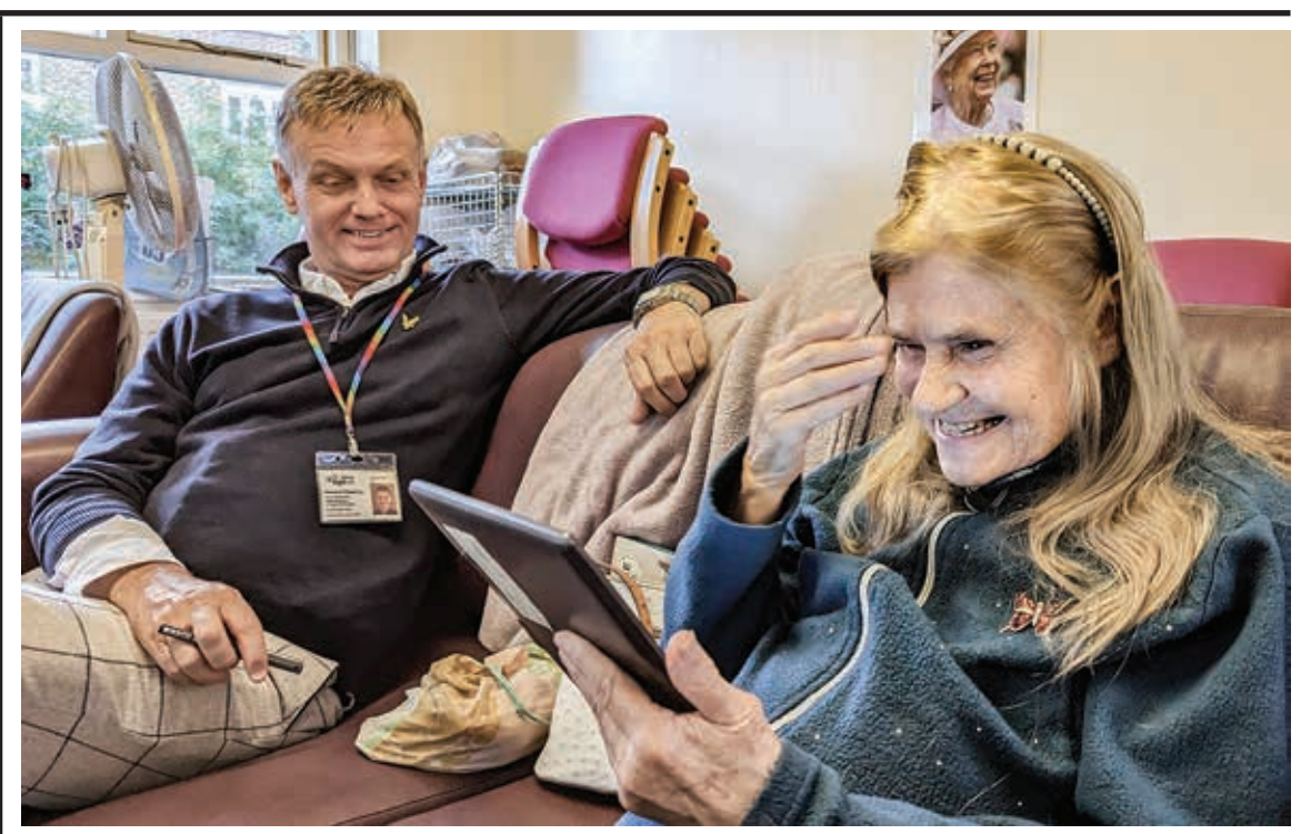
Connected: A guest gets help with her iPad at one of the Age UK digital support sessions