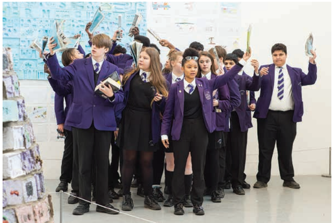
Spread the word: Young students take part in a storytelling workshop at the Artsdepot

The new zone will encompass all residential roads inside the boundaries of the North Circular, East End Road and Creighton Avenue as far as Coldfall Wood, joining up with the existing CPZs south of Leopold Road and Hertford Road. See Town Team , p7, Letters , p11.