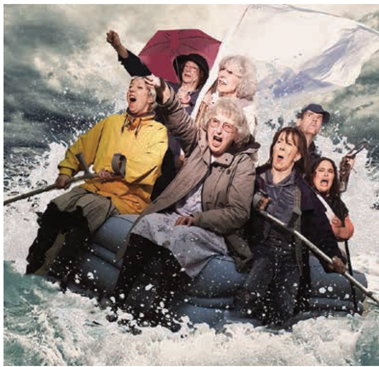
All at sea: The cast of Silver Lining at the Gatehouse