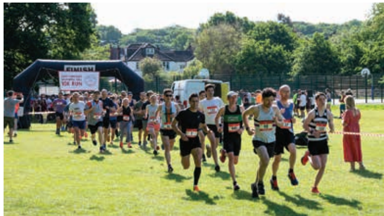
Friendly rivalry: The runners set off in last year's Race the Neighbours.