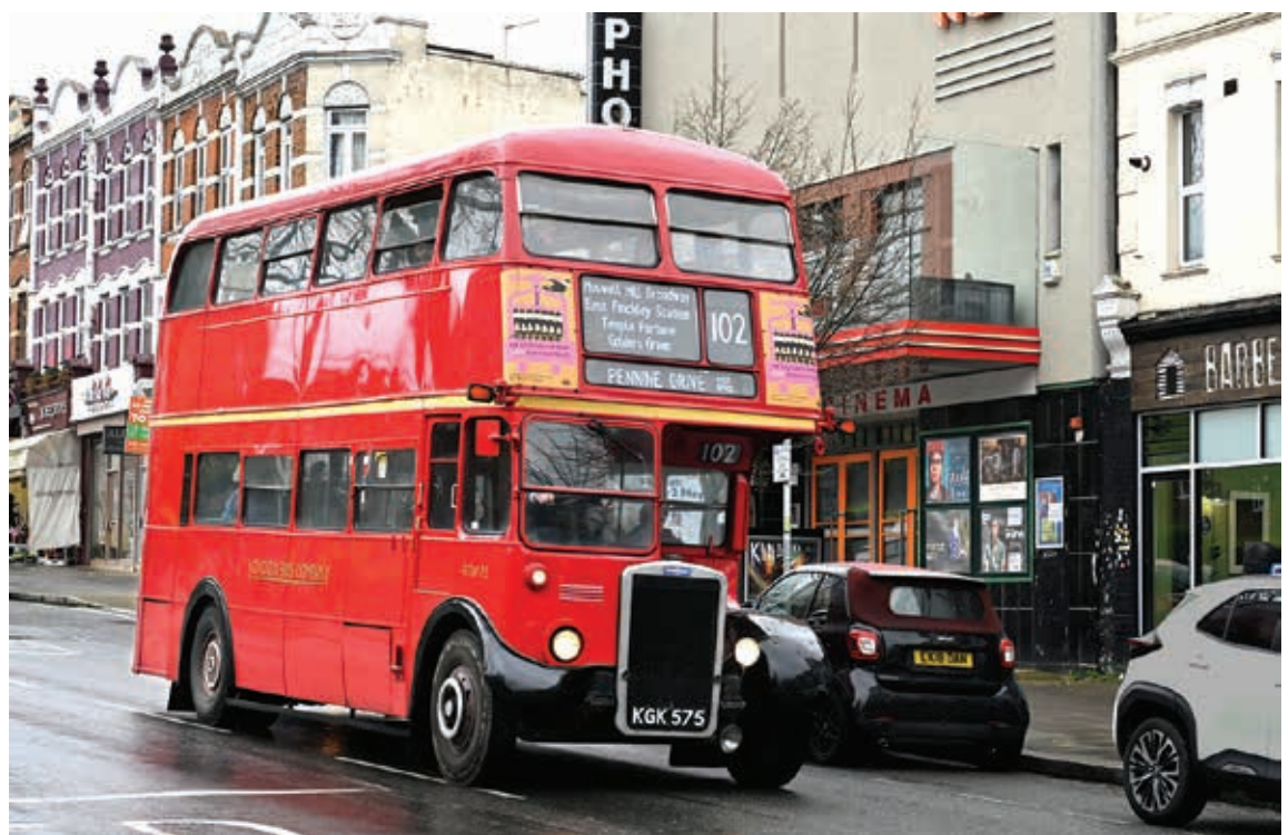
Classic sight: A vintage double-decker makes its way down the High Road past the Phoenix Cinema on one of the charity runs.