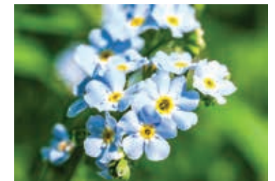
Petal power: Forget-me-nots attract pollinators

already under stress. Long term it deprives we humans of the simple pleasures of the natural world.