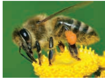
Floral dance: A bee gathers pollen

Often it is best to just leave things alone, so that a food web can develop. The 'tidying' deprives organisms of their habitat, and they are