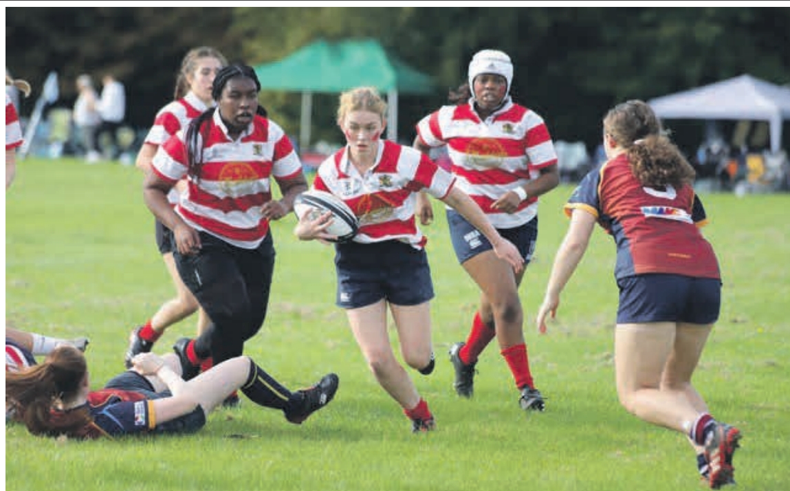
Coming through: The Finchley Girls U-18 side in action.

“Please thank everyone from the bottom of our hearts. There aren't adequate words to describe what your support means to us. It has been a roller-coaster of a time, and sadly not the fun-of-the-fair kind,” she said.