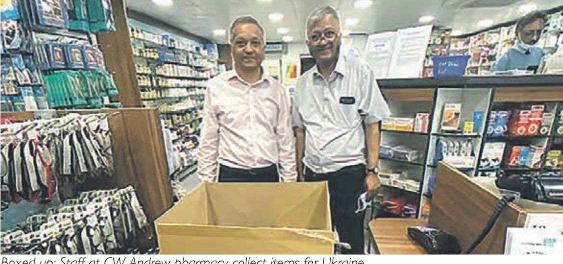
Boxed up: Staff at CW Andrew pharmacy collect items for Ukraine