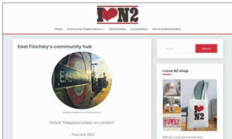
Community hub: The revamped ILoveN2.co.uk website