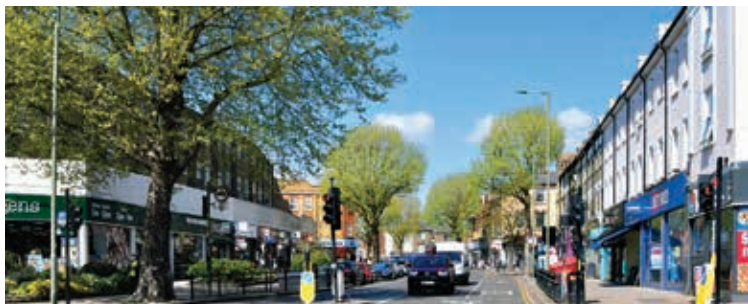
The place to go: The Town Team has plans to revitalise the High Road town centres.