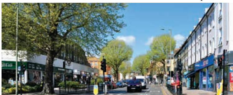
The place to go: The Town Team has plans to revitalise the High Road town centres.