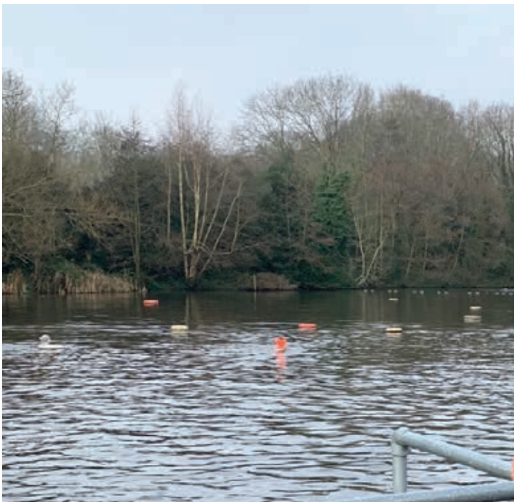
Open swimming: One of the Hampstead ponds