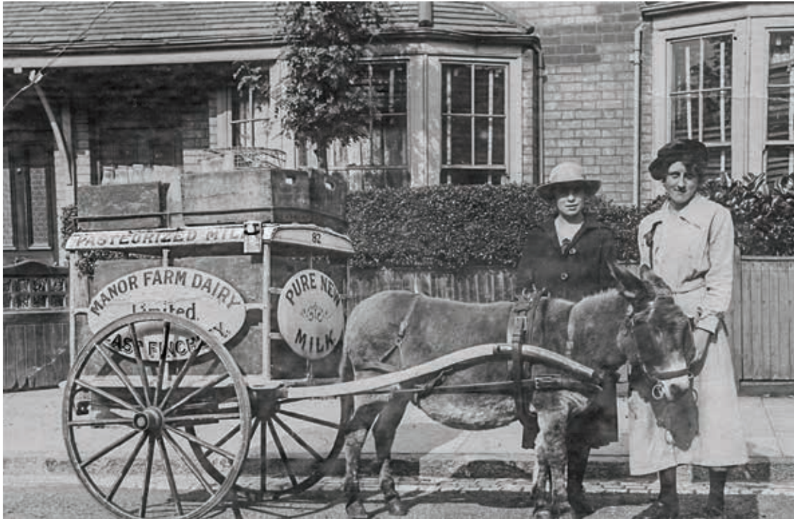
Delivered fresh: Early donkey-drawn milk delivery cart with signage emphasising "pasteurised" and "pure new milk".

Last summer one of our Archer distributors asked me whether I knew anything about a dairy in East Finchley. He had seen an old map in an atlas of North London railways that showed a siding coming off the southbound railway track, just north of East Finchley station, leading into buildings on the west side of the High Road. It was labelled 'East Finchley Dairy'.