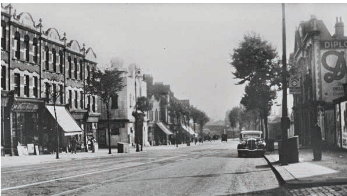
Diploma Dairy: An old view of the High Road looking south, showing Diploma House on the right, situated about where Diploma Court now stands. The name can just be seen on the side of the building.

I thought it would be interesting to try and find out more about this and my first search produced, amongst other items, this snippet from the September/October 1999 edition of this newspaper. The late Noel Lynch wrote in his Out and About column: