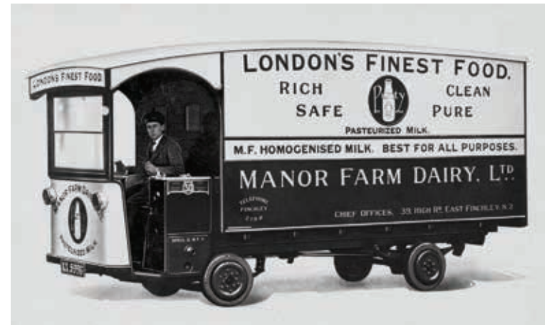
Modernisation: After carts came the electric milk float, also emphasising the benefits of Manor Farm Dairy's pasteurised milk. Note its designated maximum speed of 12mph.