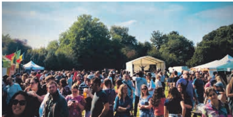
Last year's Late Summer Social in Cherry Tree Wood.

8pm on Wednesday 16 March. Contact them at eastfinchleyfestival@gmail.com or via www.eastfinchleyfestival.org