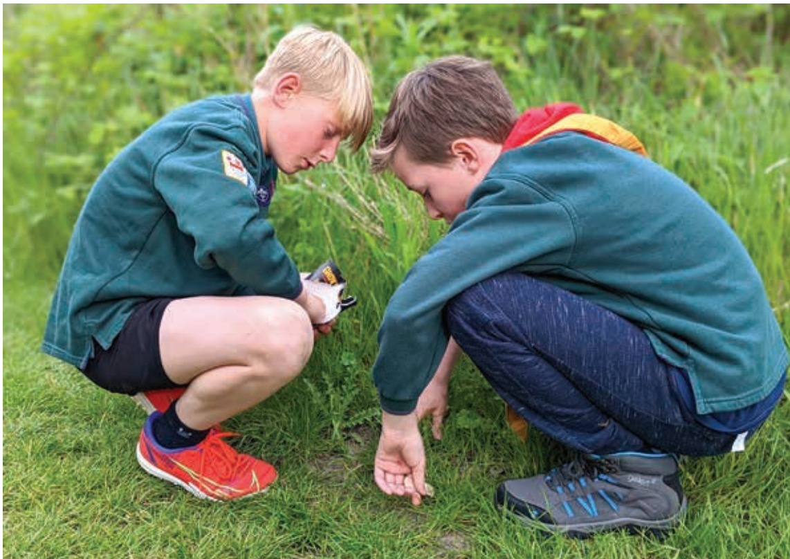
Ground level: Cub scouts explore Long Lane Pasture in extreme close-up