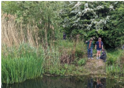
Pond life: Young Cubs enjoying the wildlife haven

The Scout meeting was occupied by a game. In small groups they were challenged to find a collection of symbols across the pasture, corresponding to a colour on the map. This sent them looking in every