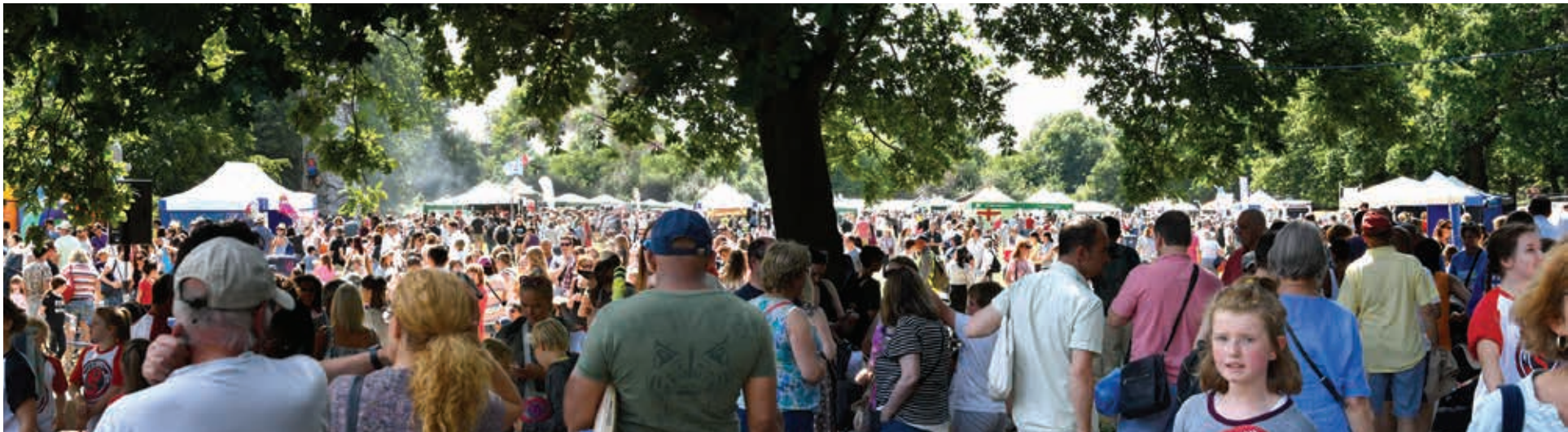
Party time: Hundreds of people packed Cherry Tree Wood in 2019.