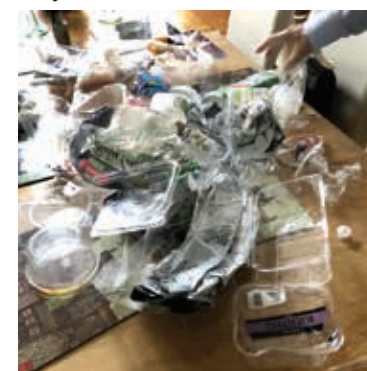
More than expected: Maxine's haul

In normal circumstances, I take my own bag and buy fruit and vegetables locally and only need a plastic bag for a very few items that may get squashed. But I can afford to buy from a green grocer. When I go into a supermarket I can see that the same items in plastic punnets or in plastic bags are much cheaper.