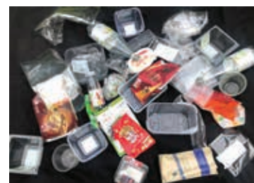
Week's worth: A friend's pile

It seems that there is a limit to what the individual can achieve. We can do our bit and persuade others but we need the backing of government to enforce more sustainable packaging for our food and other essentials. We need to make a loud noise and protest in all the ways that we can.