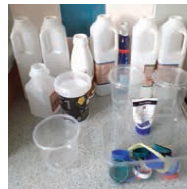
Frugal: A neighbour's plastics

This proved to be rather embarrassing, as the photos reveal. My excuse for having so much was that my brother-in-law came to stay and, not liking my vegetarian food or my cooking, went out to buy