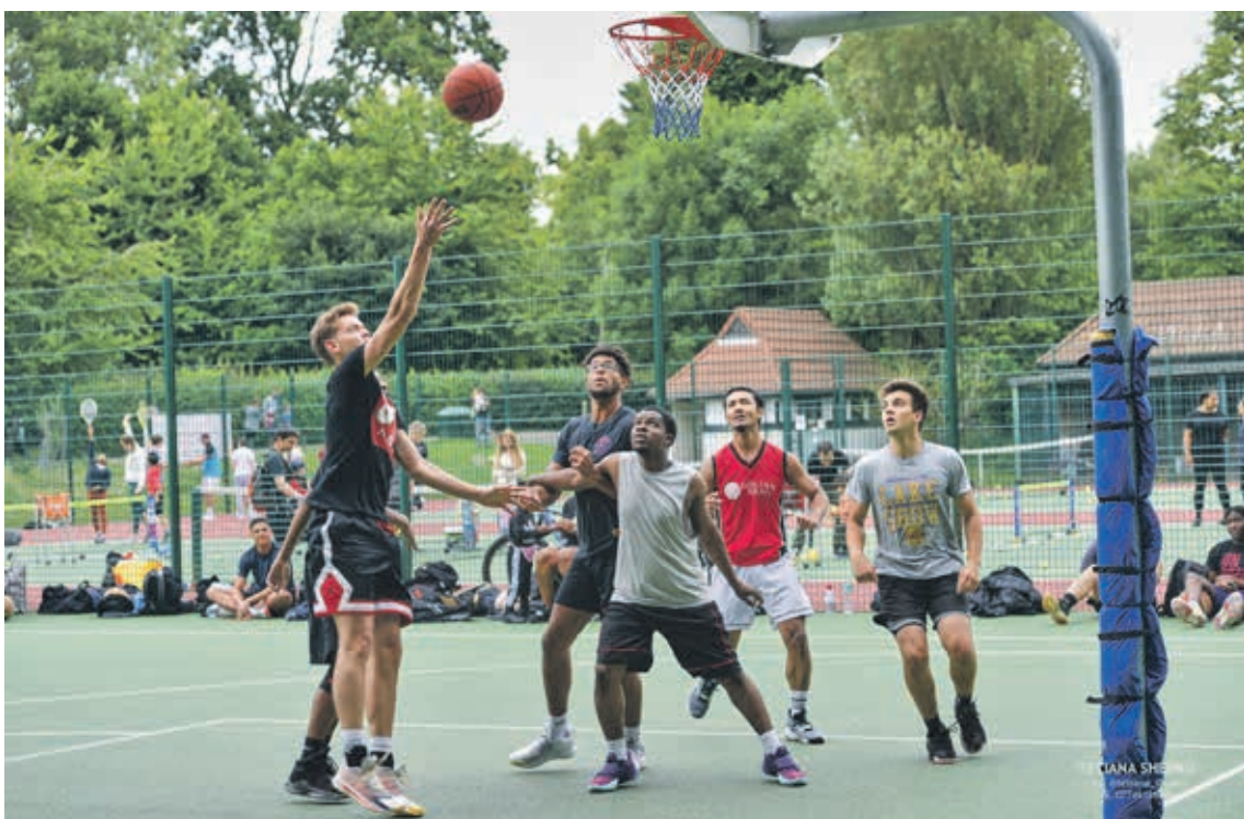
Shoot and score: Coaching action on the basketball court.