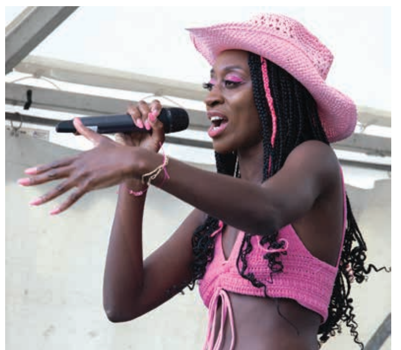
In the pink: Singer WondR WomN on the Main Stage.