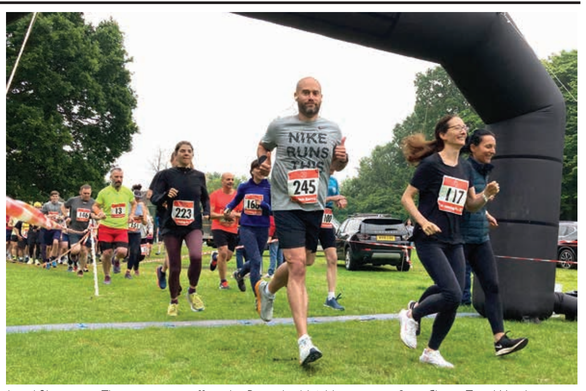
Just 10km to go: The runners set off on the Race the Neighbours route from Cherry Tree Wood.