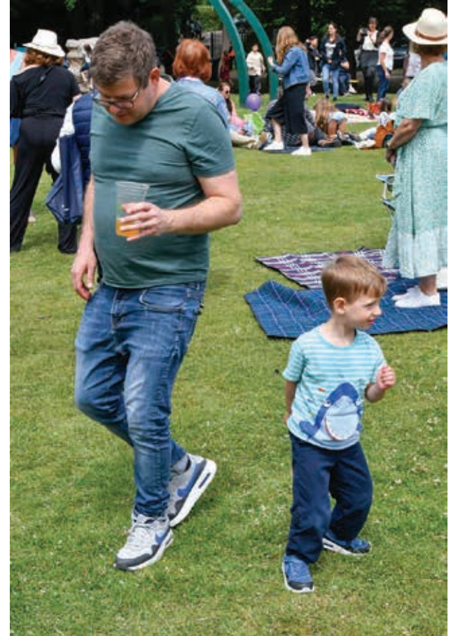
And the beat goes on: left to right, two girls jump about in front of the festival's main stage; two performers from the Madhuriya Indian classical dance group; and a father teaches his young son some dad dancing.

It seemed like the whole of East Finchley turned out to soak up the fun, and a dash of sunshine, at the 2022 East Finchley Festival in Cherry Tree Wood on Sunday 19 June. Crowds of visitors arrived early and stayed throughout the afternoon to enjoy the line-up of live entertainment, a feast of fine food and scores of stalls and attractions.