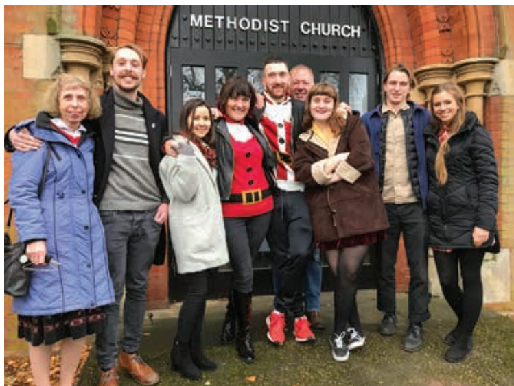
Welcome in: Worshippers are marking 200 years of East Finchley Methodist Church

the meantime, will keep you posted on what's happening through our website: www.eastfinchleymethodist.org.uk