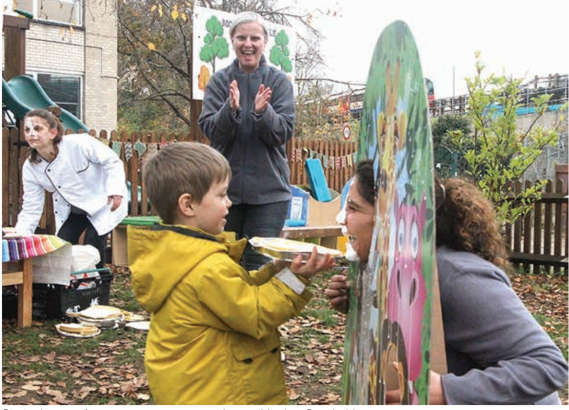
Pie in the eye: A youngster pastes a teacher at Monkey Puzzle Nursery.

Their High Road development will provide 24 flats along with ground floor office space. The original plan for 21 flats was given planning permission in 2018, in the face of opposition from more than 1,200 people whose objections centred on congestion, risk of traffic accidents, insufficient waste storage, fire safety and lack of parking.