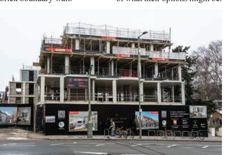
Under construction: How the High Road flats looked last month

Ball in Barnet's court A spokesperson for Barnet Council told The Archer: "The council has investigated and we are now in the process of considering what further enforcement action is necessary." They did not give details of what their options might be.