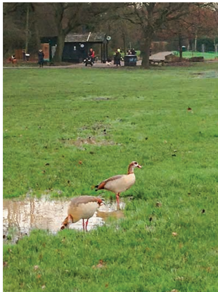
Flying visit: Egyptian geese on the waterlogged grass.

The RSPB say that Egyptian geese, which are native to Africa south of the Sahara and the Nile Valley, are frequently seen on ornamental ponds, and now can be found on gravel pits and lowland lakes and wetlands. In the UK, the north Norfolk coast holds the highest numbers.