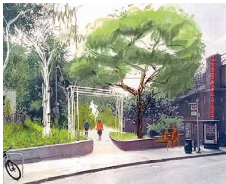
First impressions: The proposed new High Road entrance to Cherry Tree Wood

The Friends always welcome people to get in touch. They can be emailed at friendsofcherrytreewood@gmail.com