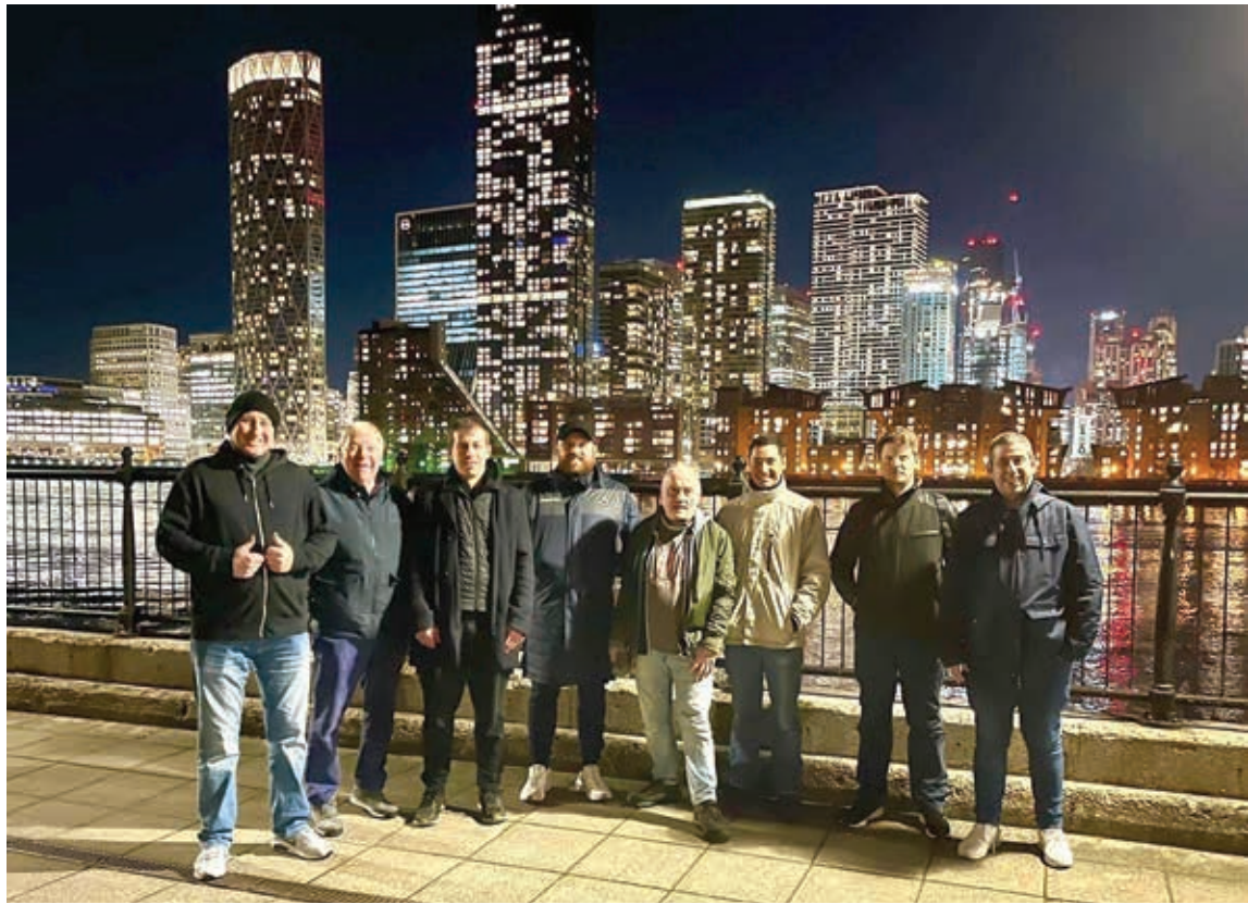
Walk and talk: The Proper Blokes Club after one of their weekly walks in Greenwich