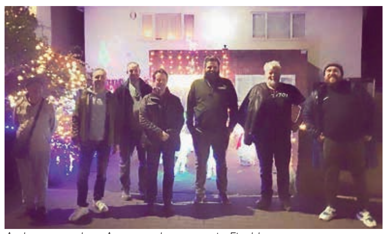
A chance to chat: A group also meets in Finchley

ferent backgrounds can all get on. It's really interesting to see people walking in their pairs or threes solidly engaged in conversation. "They would probably never have known each other before because they don't move in the same social circles so