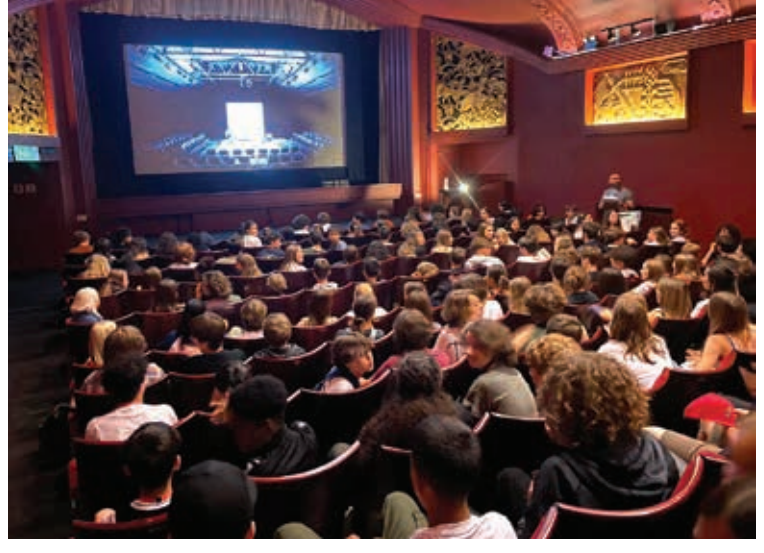
Prize-giving: Fortismere students enjoy their own Oscar ceremony

"I love the creativity our students bring to the course and their total commitment to us has meant that strong bonds have formed over the years. Many alumni are still involved in what we do; often bringing their work in or sharing their expertise."