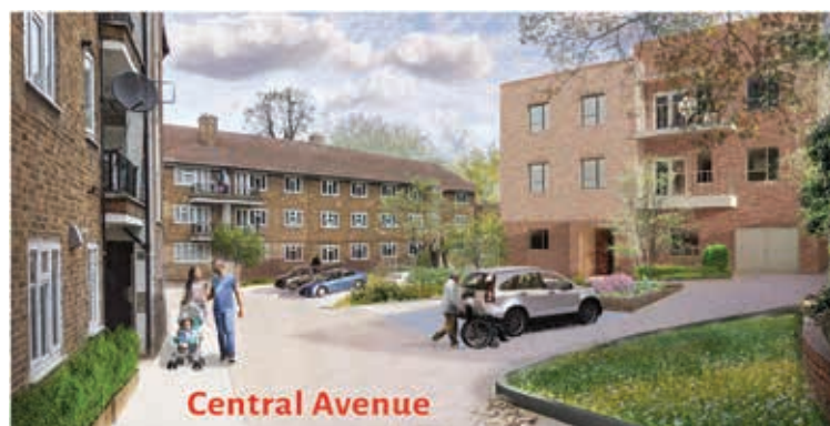
New blocks: Top and above, how the two extra sets of Grange flats are expected to look