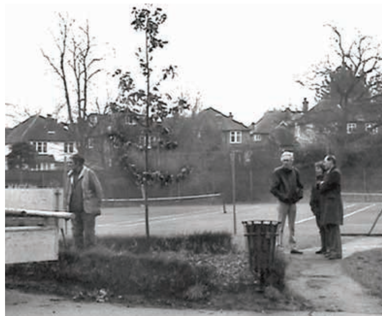
Still growing: The oak is planted in memory of Robin Chapman in 2003

However, back in East Finchley there was a different story. There the Friends of Cherry Tree Wood had planted