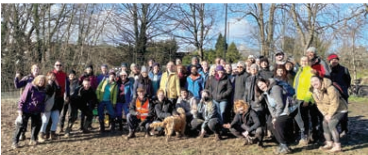
Many hands: Dozens turned out to plant trees alongside Mutton Brook