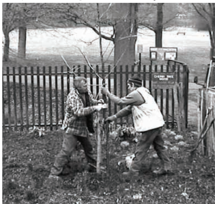
Anniversary: The cherry tree that marks The Archer's 10th birthday

Vandalised: The broken saplings in the Glebelands