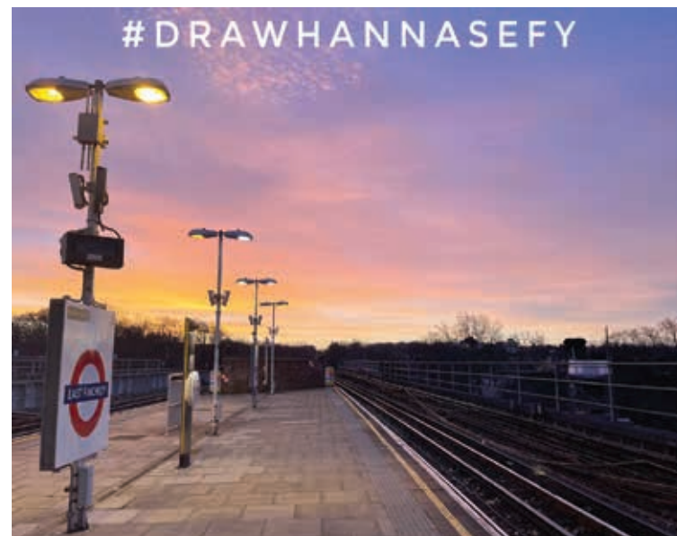
Inspiration: Above, Hanna's original sunrise photo and, below, the painting she created from the scene