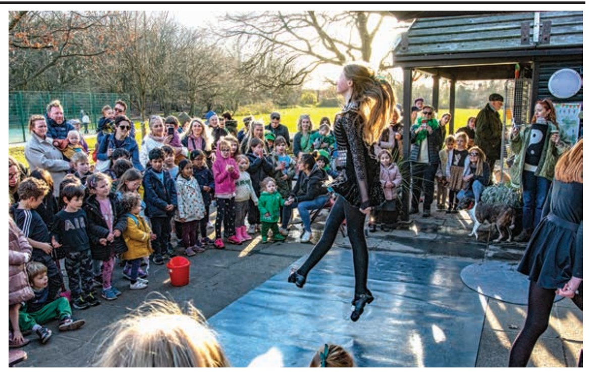
High-kicking: One of the Celtic Hearts Irish Dance group appears to float in mid-air in front of a fascinated crowd at the Cherry Tree Café on St Patrick's Day.