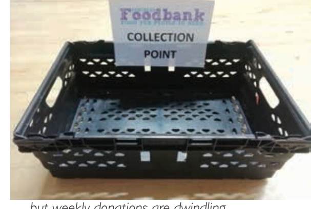
... but weekly donations are dwindling.

available for general household & garden maintenance. No Job Too Small Free Estimates John on: 0789 010 3831 or: 0208 883 5325