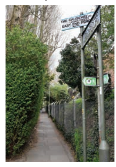
Monitored: The Causeway

The camera was installed on this busy alleyway behind the tube station last September following a campaign by Causeway residents, supported by local councillors and triggered by two major incidents on the footpath.