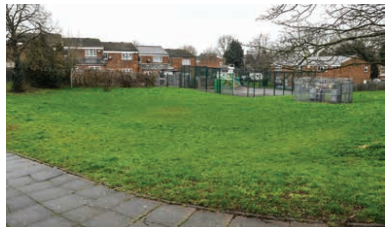
Brownswell green now: Proposed block A would occupy the foreground and block B would take the place of the three homes on the right, beyond the green.

The Archer asked Barnet Homes how much green space was covered over by the first design and how this compares with the revised plans. A spokesperson said that this