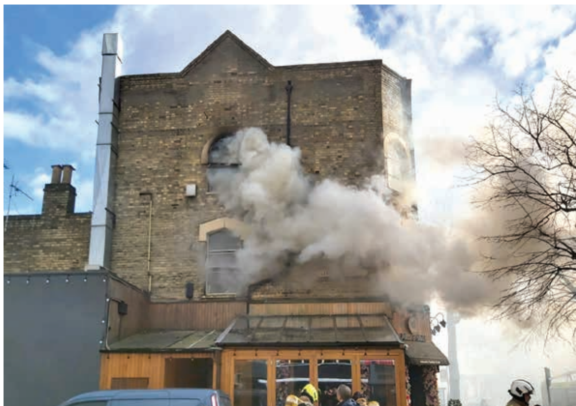
Ablaze: Fire crews in attendance as smoke billows from the second-floor flat.

Cyclist, drivers, traders and all residents are invited to give their views on the changes via the new A1000 Experimental Cycle Route consultation online questionnaire, which closes on 12 August. To complete it, go to www.barnet.gov.uk and find the Consultations page. To request a paper version or for help and further information, phone 020 8359 3281 or email highwayscorrespondence@barnet.gov.uk . Alternatively, you can write to Highways, London Borough of Barnet, 2 Bristol Avenue, Colindale, NW9 4EW.