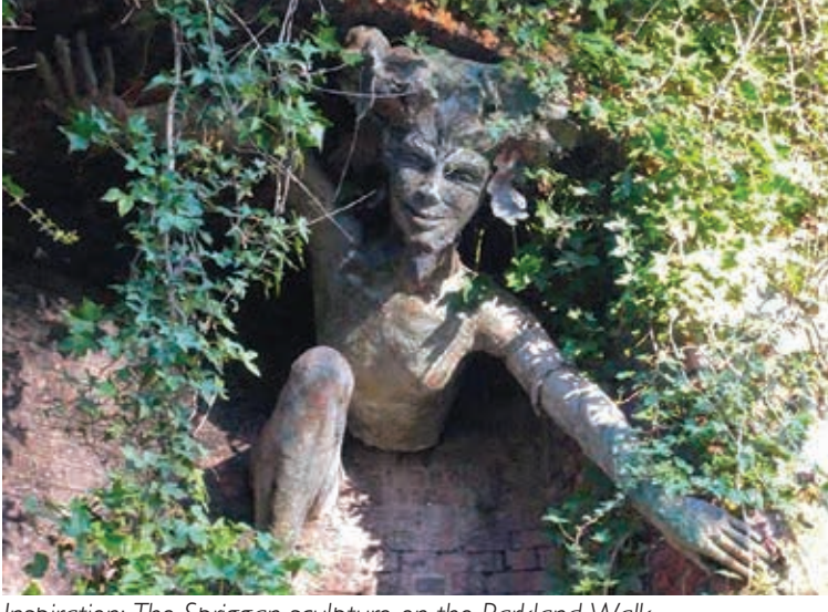
Inspiration: The Spriggan sculpture on the Parkland Walk

Other photographs in the exhibition will show Cherry Tree Wood where photographer Dayvid Grant, a man with a