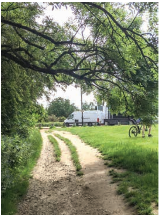
High point: This path emerges from Hampstead Heath near the pond at the top of the village.

on the verge as it is bike-friendly and easier) and continue along this road into the Heath again. You will eventually arrive at Whitestone Pond and at the roundabout veer right onto Spaniards Road. Use the cycle path next to it (preferably via the crossing as vehicles here go pretty fast) and once you spot the flower stand at Span-