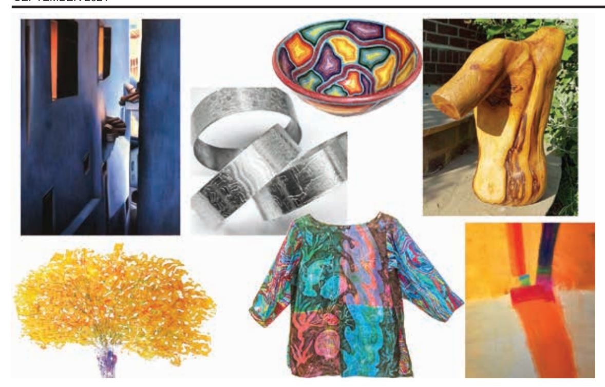
Browse and buy: A wide range of arts and crafts will be on show during the Open Houses event.