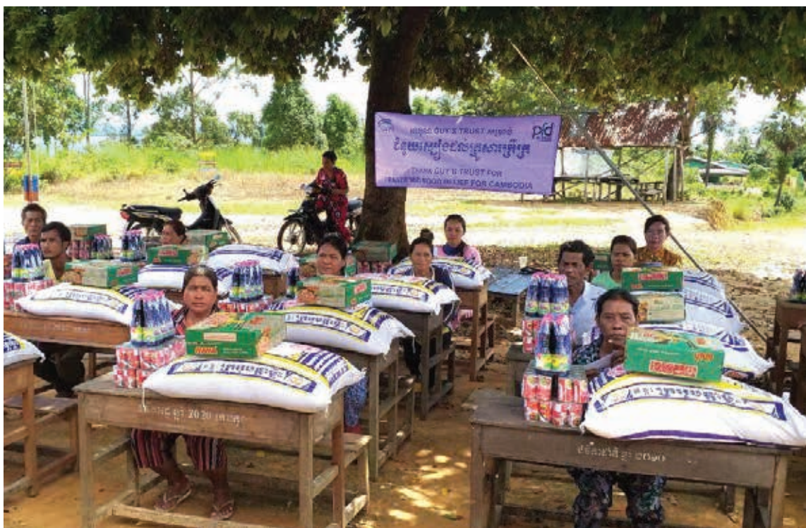
Essentials: Food supplies from Guy's Trust reach Cambodian villagers who have lost their source of income in the pandemic.

A community newspaper for East Finchley run entirely by volunteers.