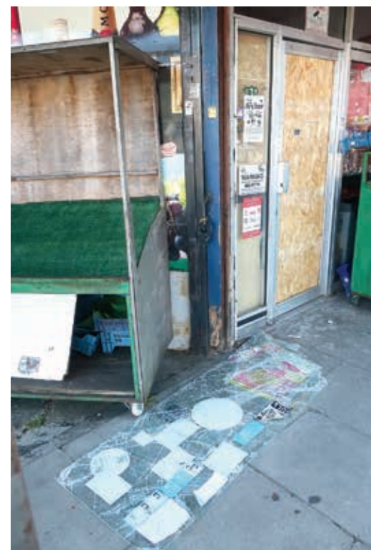
Smashed: Glass from the front door lies on the ground after the break-in at Ella Food and Wine.

The Ella burglars were caught on camera driving their black Audi straight onto the wide pavement in front of the shop at 4am. One of them kept watch while another kicked the front door in. Once inside they stole all the cigarettes, then fled. As we reported last month, the King Street burglary was also recorded on CCTV. The footage showed three white men turning up at 4am and smashing their way in and out in five minutes. The owners there had only just finished repairing flood damage from the torrential rain a week earlier.