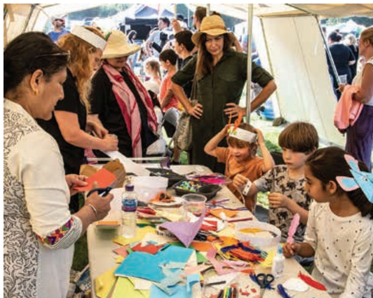
Crafts in the kids' tent, run by LBL Club