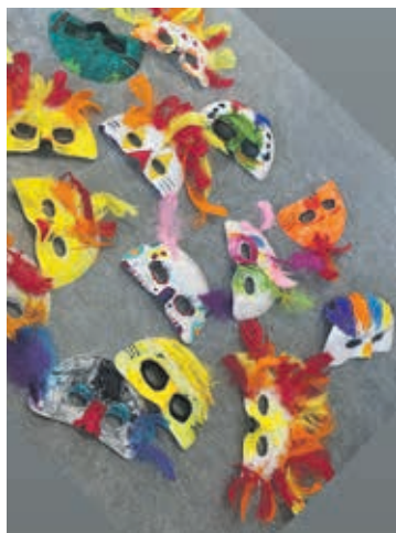
Masquerade: These masks were made by children at a GBL funded summer school

The free fun day will also be a chance for the GBL team to