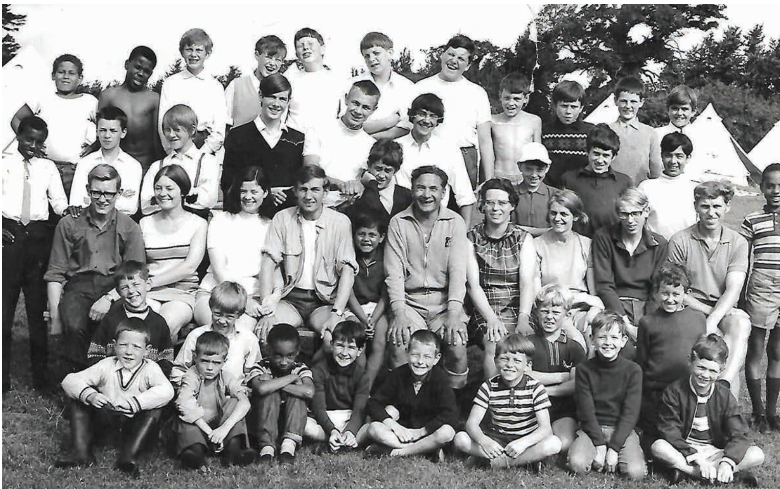
Faces from the past: East Finchley Methodist Church is trying to trace anyone in this photo of a Boys Brigade camp from the 1960s.