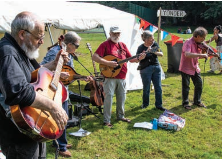
Folk group Dorten Yonder