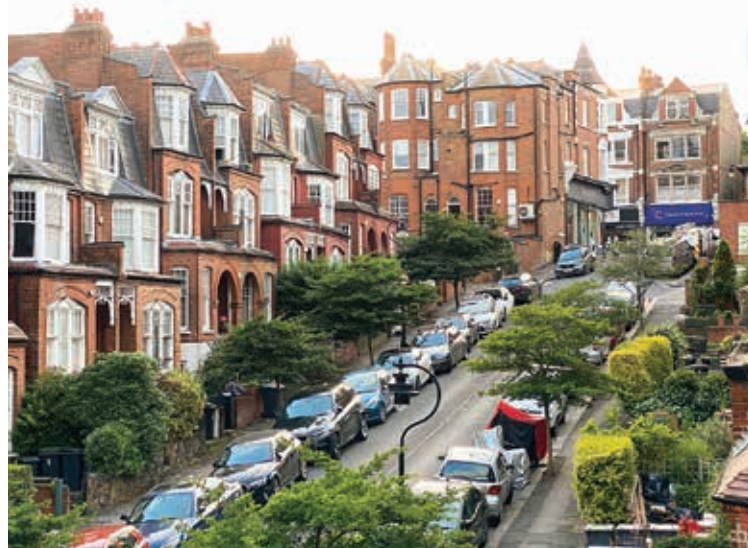
Muswell Hill: Funds are available for projects that benefit the community.

The Muswell Hill and Fortis Green Association has launched a Community Fund, making up to £500 available to fund local projects that benefit the community.