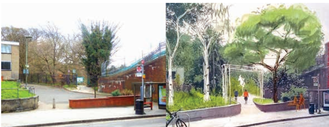
Before and after: How the wood entrance looks now, left, and an artist's impression of the new layout