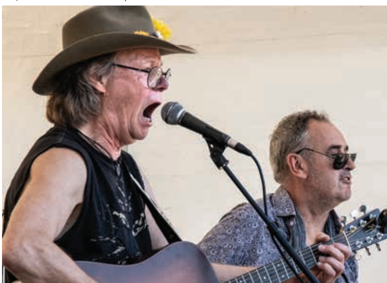
Rangoon headlining the music stage

It was a major feat of organisation for a hardworking group of volunteers at the East Finchley Festival CIC (Community Interest Company) who put the whole thing together in a matter of weeks once they knew that government restrictions would allow it. And they were joined by dozens more volunteers on the day who signed up to marshal stallholders, help the crowds and sell raffle tickets and merchandise.