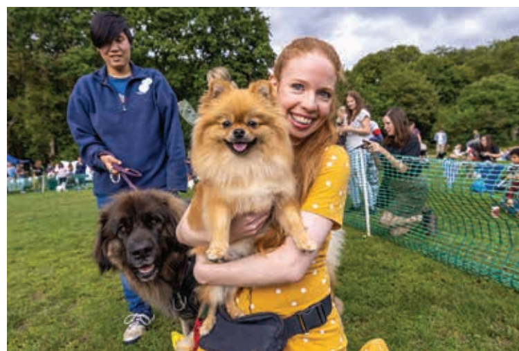
All smiles: One dog photobombs another's portrait shot at the show.

Dozens of canine pals turned out to enter for rosettes or just to watch from the sidelines, many of them rescue dogs who found their families thanks to the East Finchley charity's work. All of them mixed happily and were on their best behaviour throughout, seeming to enjoy the company of so many other dogs. There wasn't even much barking. The event was hosted by actor Michelle Collins, who kept the judges on their toes and chatted to owners as they paraded round the ring with their pooches. All Dogs Matter is based in Aylmer Parade, N2, and has been working for years to rescue and rehome animals. Last year alone, the organisation rehomed 300