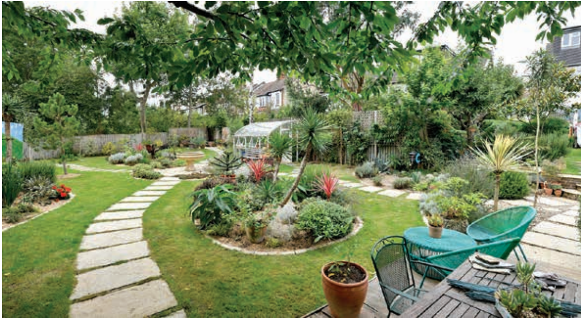
Paths of glory: Walkways criss-cross David Gilbert's stunning garden of exotic plants.

It's not often you walk through a house in East Finchley to find yourself in the tropics. In a T-shaped garden in Lauradale Road belonging to David Gilbert, a generous and more conventional first section leads down to a larger area full of curving pathways and hardy exotics.