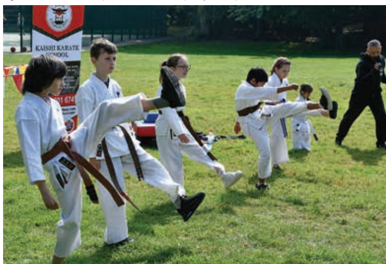
A free karate workshop with Kaishi Karate School