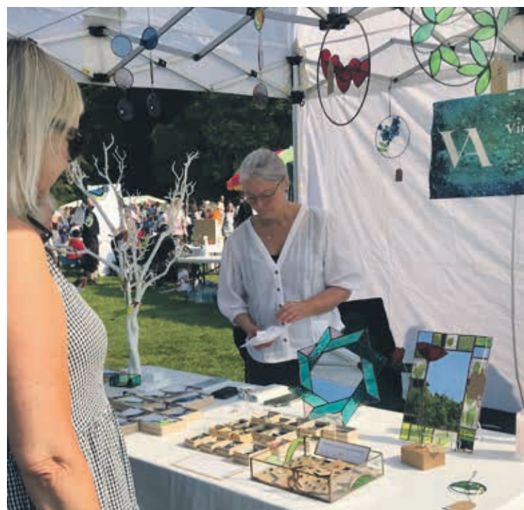
A huge range of local crafters and makers shared their wares