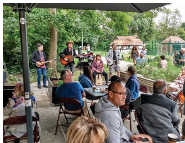
Musical opening: Rangoon play for the crowd at the Cherry Tree Wood Café's first day.

The café is open from 9am to 5pm daily with some shelter at the side to avoid showers.