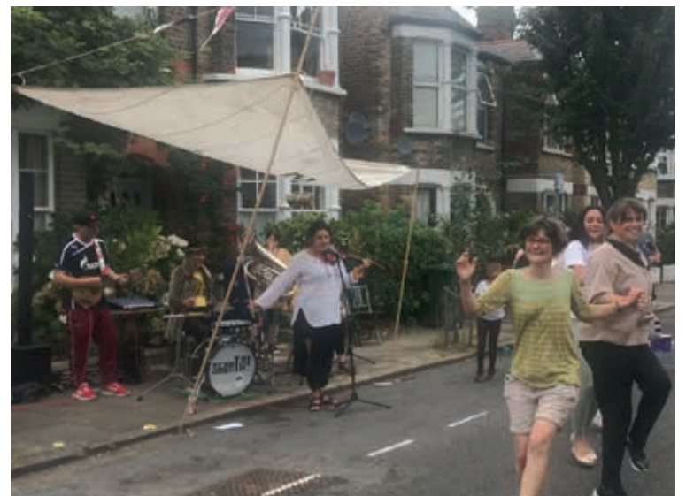
Party: Residents dance to Balkan band, Shunta.

Report crime by calling 101 or in an emergency call 999. Remember, you can also report crime online on our website: www.met.police.uk