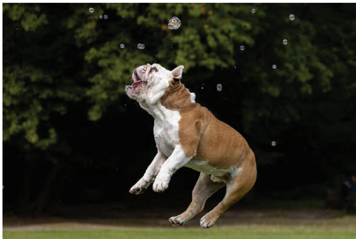
Jump for joy: A bulldog has some fun at the All Dogs Matter show.

There are some options to help with costs related to this proposal. To check if you are entitled to any financial support, please call the Age UK Advice Line on 0800 169 65 65 or NHS Help with Health Costs helpline: 0300 330 1343. More links to assistance are on www.ageuk.org.uk/campaigns .