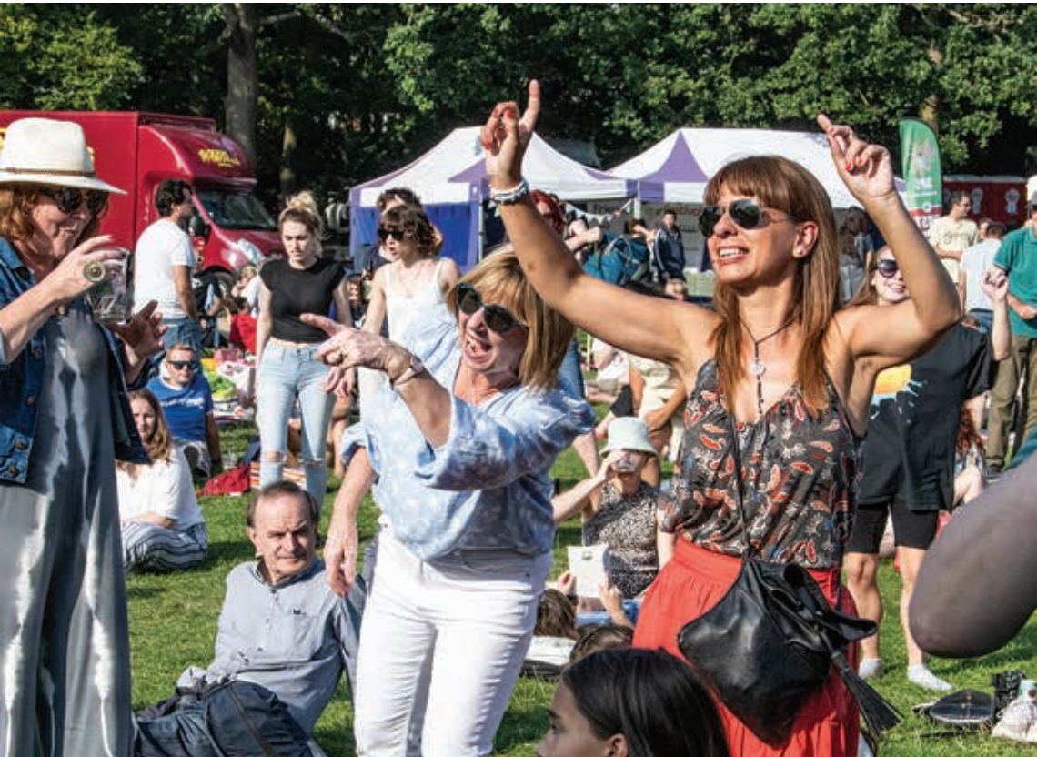
Crowd pleaser: People getting into the groove in front of the music stage