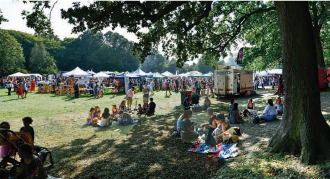
Shady spot: Friends and families picnic under the trees