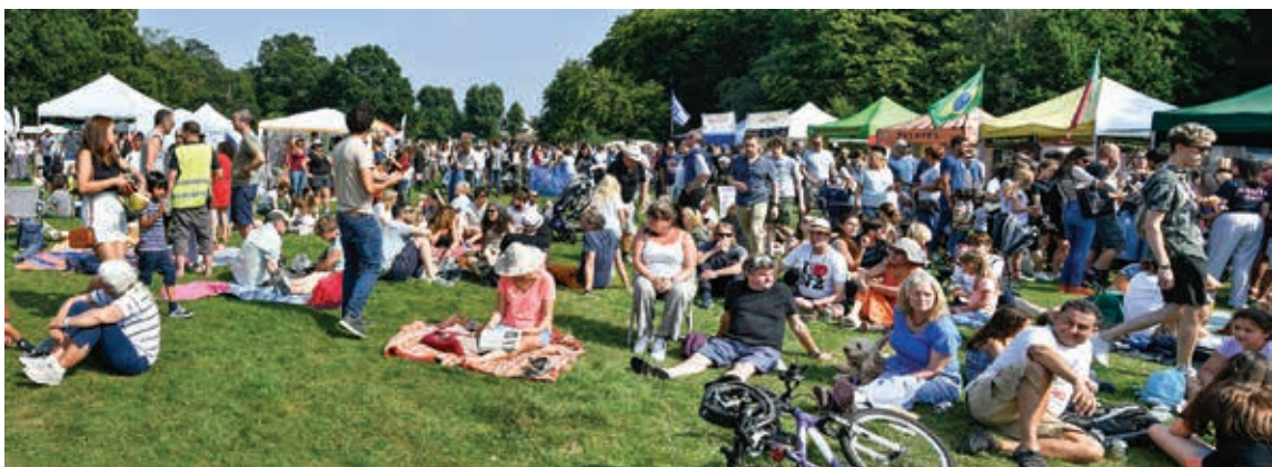
Time to relax: Festival-goers enjoying the food and music in Cherry Tree Wood