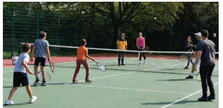
Free tennis coaching with Stormont Tennis Club