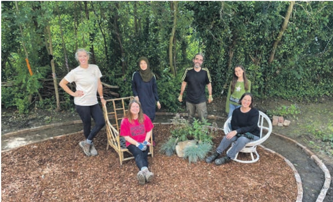
Time to relax: Volunteers at the Archer Academy community garden funded by GBL