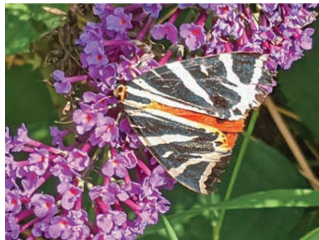
Distinctive: A Jersey Tiger moth spotted in Coppetts Wood.

The Jersey Tiger moth is thought to have first come to England in the 1970s and until recently was most often seen in Dorset, Devon, Sussex and the Isle of Wight. It favours rough undisturbed grounds, much like Coppetts Wood, and feeds on nettles, buddleia, borage and nettles.