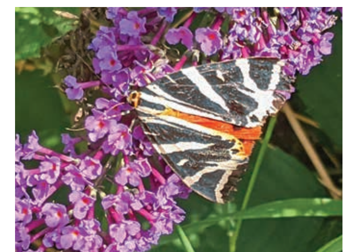
Distinctive: A Jersey Tiger moth spotted in Coppetts Wood.