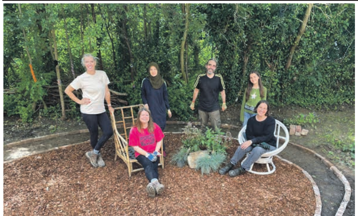
Time to relax: Volunteers at the Archer Academy community garden funded by GBL