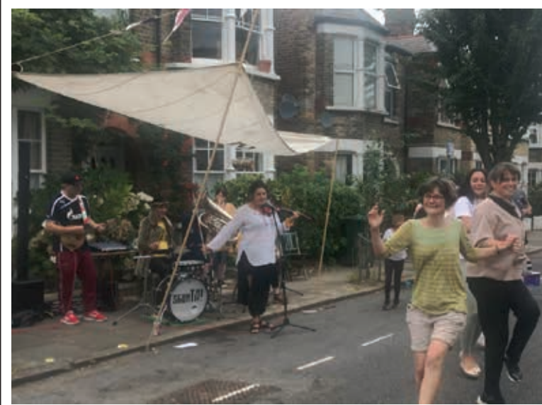
Party: Residents dance to Balkan band, Shunta.

Report crime by calling 101 or in an emergency call 999. Remember, you can also report crime online on our website: www.met.police.uk