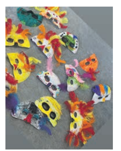
Masquerade: These masks were made by children at a GBL funded summer school

The free fun day will also be a chance for the GBL team to